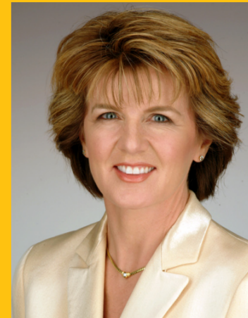
The Hon Julie Bishop Federal Minister for Ageing, Australia