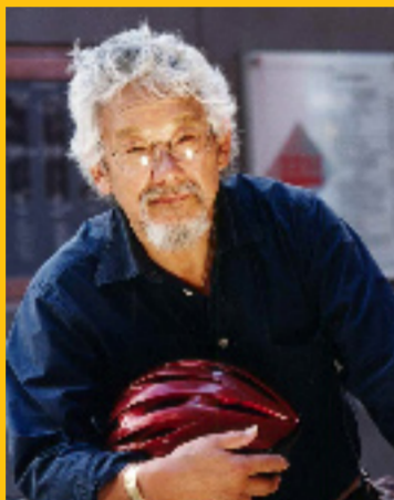
Dr. David Suzuki Internationally Renowned Award Winning Scientist, Environmentalist & Broadcaster